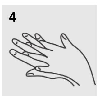
Rub back of each hand with palm of other hand.