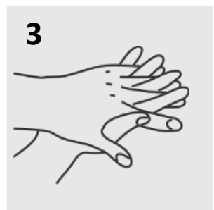
Rub in between and around fingers.