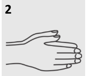
Rub hands together, palm to palm.